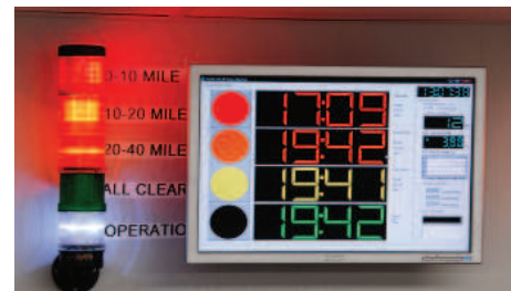
Stacklight connected to an ERL-10 (stacklight not included)