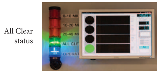
All Clear status