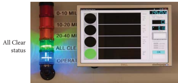
All Clear status

The ERL-10 Status Monitor software (included) allows the system status and countdown timers to be displayed. Countdown timers clearly indicate the number of minutes:seconds until All Clear. All alarm activations are timestamped and logged to disk. Configuration software and graphical log-file viewing software is also included.