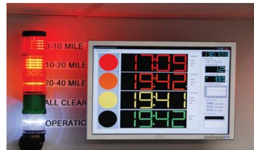
Stacklight connected to an ERL-10 (stacklight not provided)