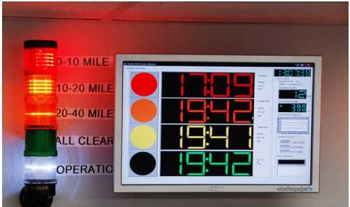
Stacklight connected to an ERL-10 (stacklight not provided)