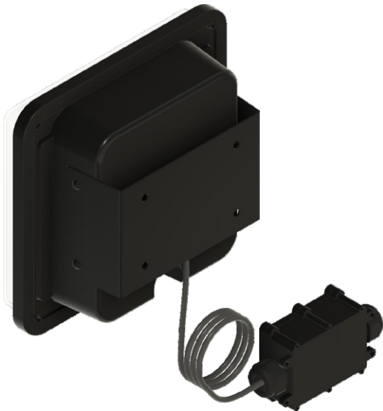
Bolt-180 with provided cable and electrical termination box