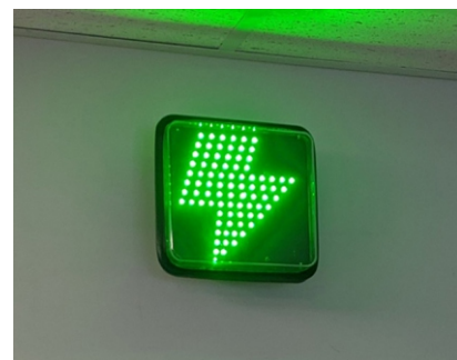
Bolt-180-RYG Typical Installation